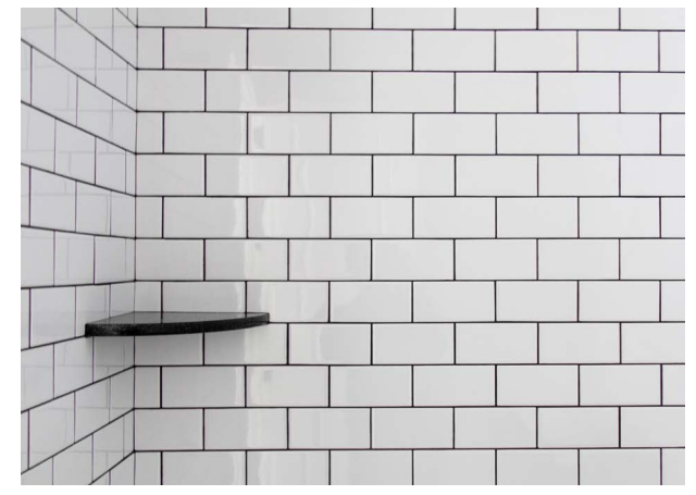
Black Granite Polished 10" corner shelf