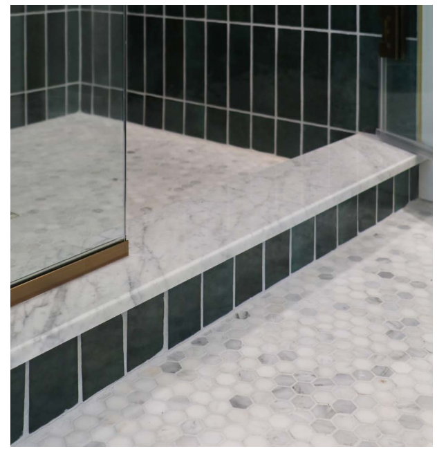
Ven. Carrara curb and hexagon mosaic