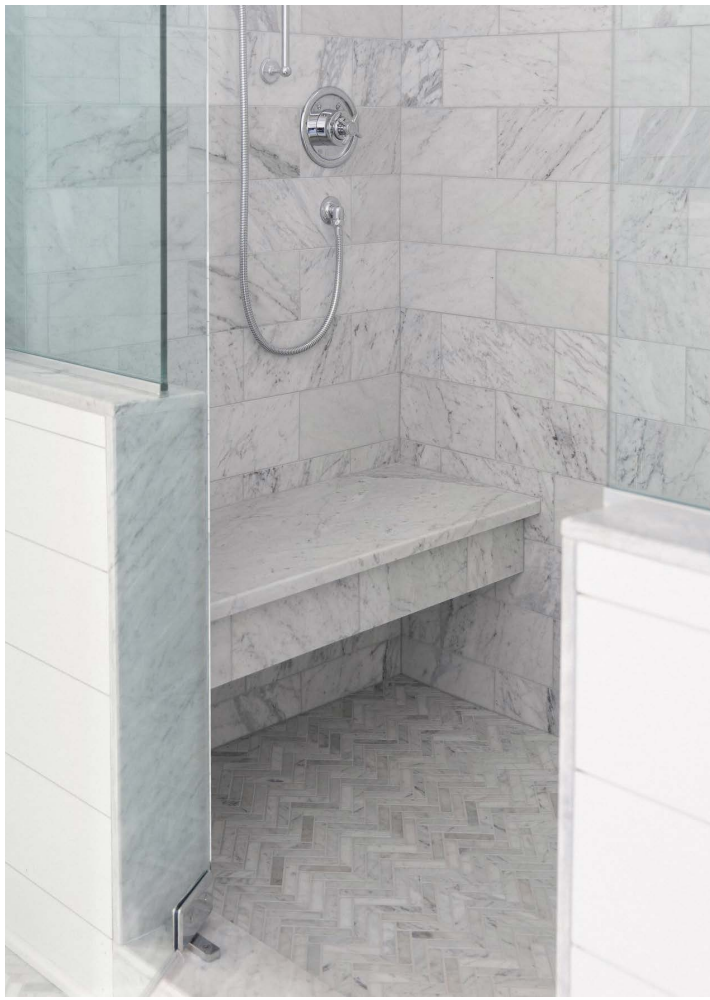
Ven. Carrara curbs, bench, 6"x12" tile, and herringbone mosaic