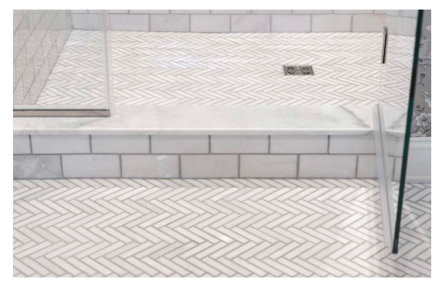
Glacier White curb, 3"x6" tile, and herringbone mosaic