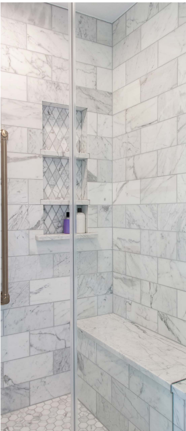
Statuary Bench, 6"x12" tile, hexagon mosaic