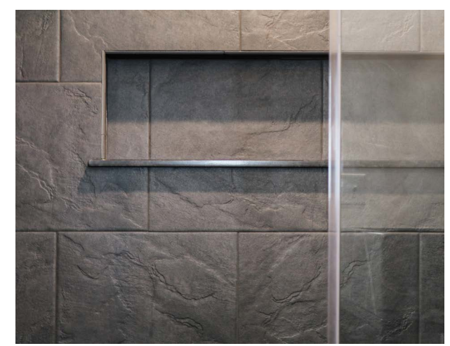
Black Granite Polished 10" Curb