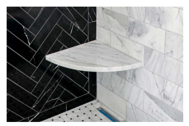
Statuary 20" Seat, 6"x12" tile, basketweave, Nero St. Gabriel 3"x12"