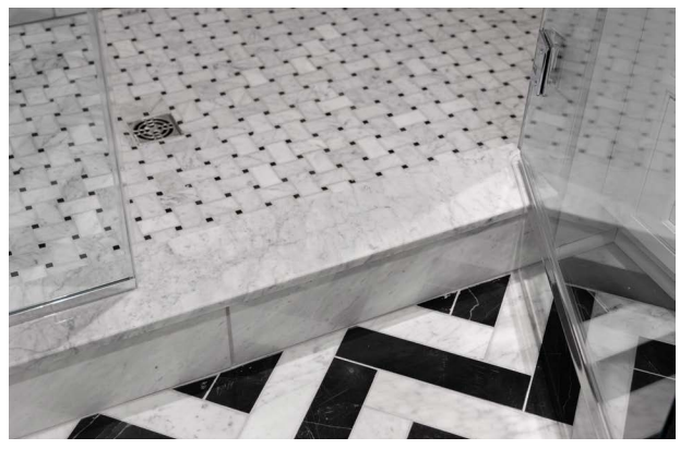
Ven. carrara curb, basketweave, 3"x12" tile, Nero St. Gabriel 3"x12"