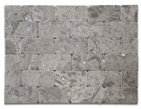
Shown in a tumbled finish

Custome Tile Finishes: Honed, Brushed, Tumbled, Chiseled